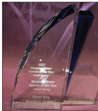
WaterReuse Association of California's 2022 Recycled Water Agency of the Year

Funding for this $22.6 million recycled water project (West Bay Sanitary-Sharon Heights) has been provided in full or in part by Proposition 1. The Water Quality, Supply, and Infrastructure Improvement Act of 2014. Funding has also been provided through the Clean Water State Revolving Fund, which is capitalized through a variety of funding sources including grants from the United States Environmental Protection Agency and state bond proceeds.