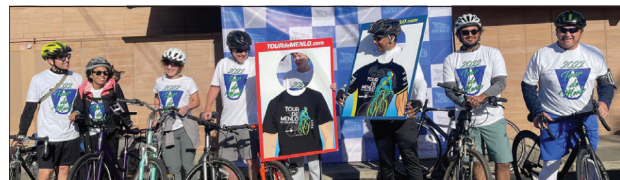
Participating in the Rotary Club of Menlo Park Foundation's Tour de Menlo