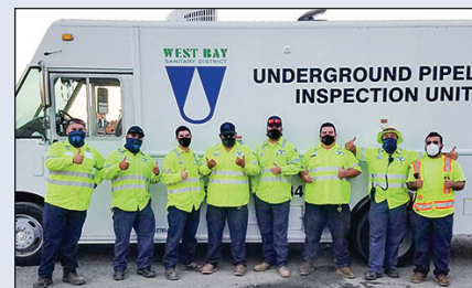
West Bay maintenance and construction crews.

I'm very grateful to have such a self-motivated staff and supportive Board of Directors. No challenge is too great for West Bay Sanitary District. Through this unusual 2020 calendar year we have now entered into the next phase of West Bay's history by opening our first Recycled Water Facility. The facility provides up to 500,000 gallons per day of recycled water used for irrigation purposes. This effort reduces the need to use fresh drinking water for irrigation purposes. We are working on the second recycled water facility in the Bayfront Area as we speak.