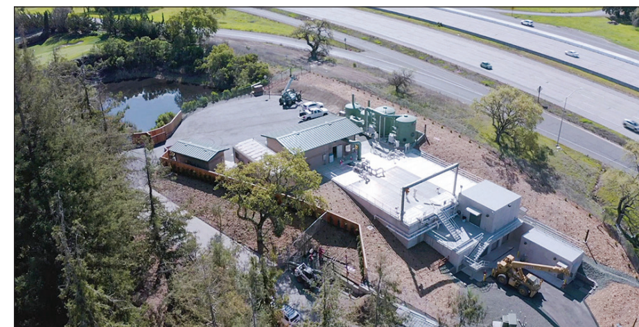
Recycled Water Treatment Plant Sharon Heights.

The State Revolving Fund loan will be paid back by Sharon Heights Golf & Country Club.