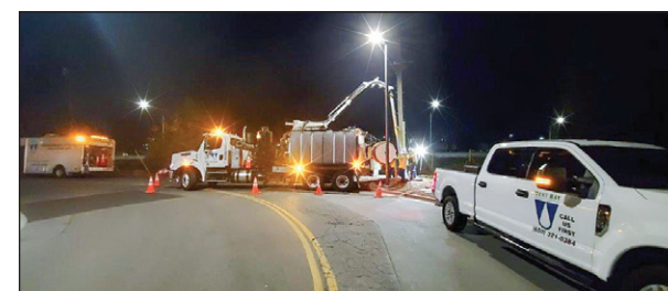
West Bay does night-time work.

West Bay Sanitary District Pipe Line Inspection Unit is the "underground eyes" for the District. Part of the operation and maintenance program includes the video inspection of each sanitary sewer pipe in the District via CCTV (Closed Circuit Television). Recently the District's Pipeline Inspection