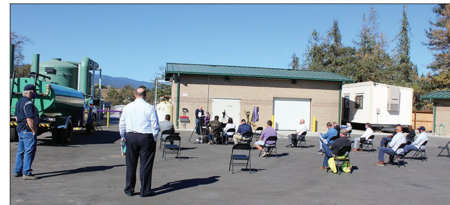
Ribbon cutting ceremony.

The District is proud to report the water reuse partnership with Sharon Heights Golf and Country Club is off to a fantastic start! Since late July 2020, the District has delivered in excess of 20 million gallons to the course for landscape irrigation. The benefits to a recycled water partnership include reducing demands and stress on the Hetch Hetchy freshwater supply, eliminating the need to transport water, reducing environmental impacts, and improving sustainability. The District is currently pursuing the many avenues for water reuse, such as for toilet flushing, dust control on construction projects, street sweeping, and water for cooling towers. The District is very excited to be a part of this program with a commitment to community and environmental stewardship!