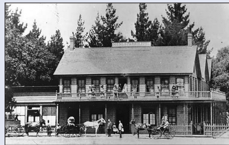
Menlo Park Hotel