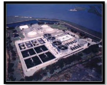
SVCW Regional Treatment Plant

Customers pay only for the proportional cost of their service. The proposed rate increase will provide funds to pay for the District's planned operational costs, capital improvements through June of 2022 (including engineering, administrative, and implementation costs.) The proposed rate increase will also cover the ongoing SVCW Operations & Maintenance costs, as well as, repay the District's share of principal and interest on SVCW loans and bonds, for their capital construction during this period.