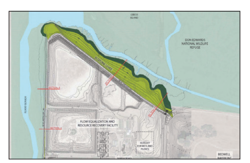
Levee Improvement Site Plan

The District's Levee Improvement Project proposes to protect the site from flooding and sea level rise by installing sheet pile walls along the western perimeter of the facility and construction of a structurally supported ecotone levee along the north perimeter to promote shoreline resiliency and marsh habitat after sea level rise. The levees will be raised to Elevation 15 (NAVD88). The ecotone levee will create a wider upland transition zone with approximately 3.5 acres of high-quality native upland refugia habitat for both rare and common wildlife